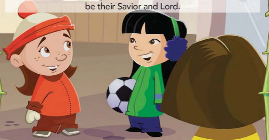
*Name changed for security reasons.